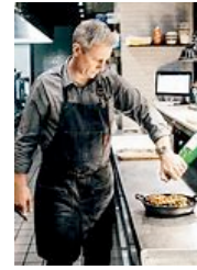
Chef Andrew Zimmerman