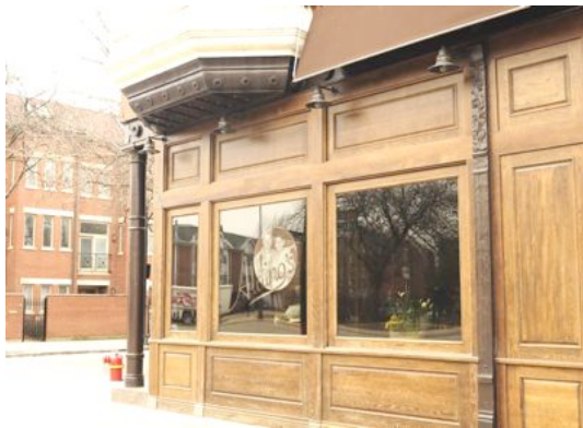
ChicaGourmets! Hosts Don Newcomb & Jim Price

"Aldino's is a casual neighborhood restaurant located in the old Taylor street Italian section of the city of Chicago. The restaurant features dishes from all regions of Italy in a style that we like to call Italian Comfort Food. We promise to source the best possible local products possible by working directly with local farmers in order to give the customer a high quality meal at a reasonable price. We know that everyone will wish there was an Aldino's at the end of their block."